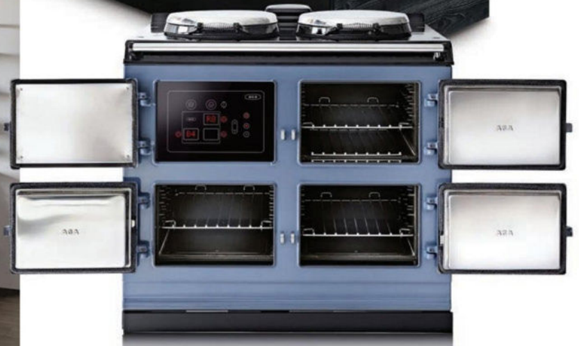
ABOVE: The AGA Classic range may look vintage, but it boasts all the trappings of modernity: precise temperature control, the latest materials, and insulated design to preserve the integrity of the foods being cooked. agarangeusa.com