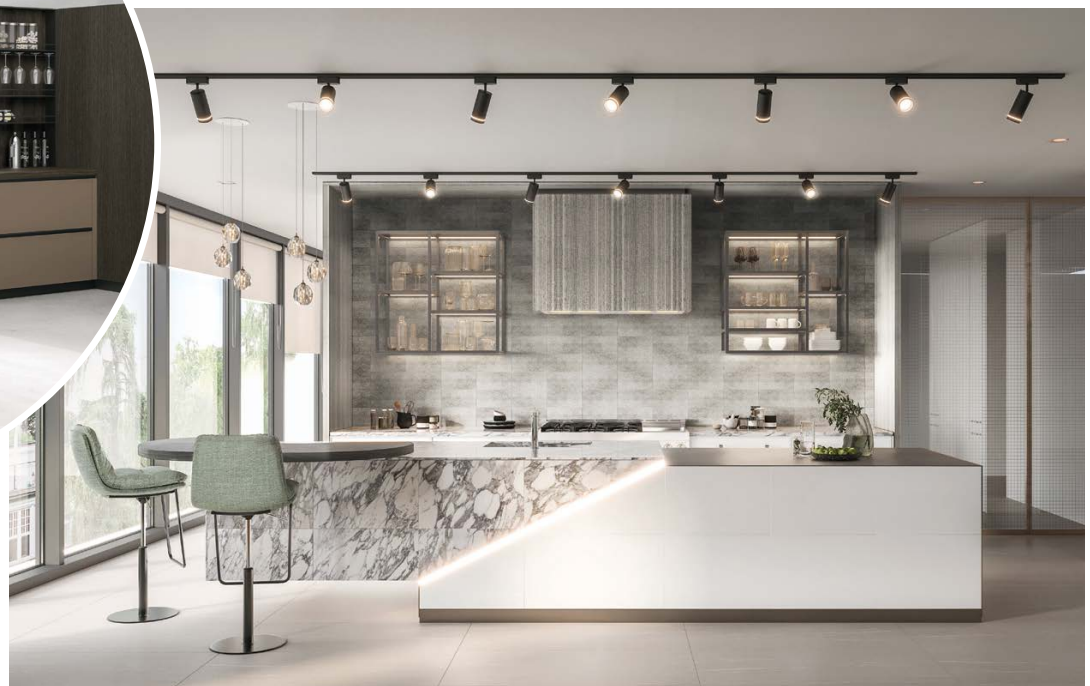
ABOVE: The table attached to the island of the Metropolis kitchen by YAMINI provides an angular element that energizes its overall design. yaminikitchens.com