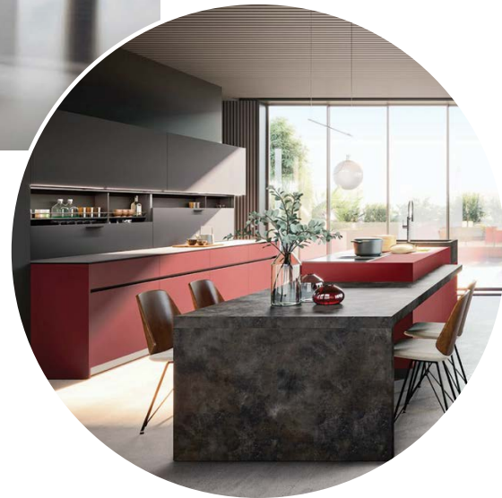
RIGHT: Designed by Davide Bot for MANDICASA , the Tau island comes down a few inches to create a natural stone dining surface for four. mandicasa.com

KITCHEN ISLANDS INCREASE THEIR UTILITARIAN VALUE WITH EXTENSIONS THAT ARE BOTH PRACTICAL AND ELEGANT