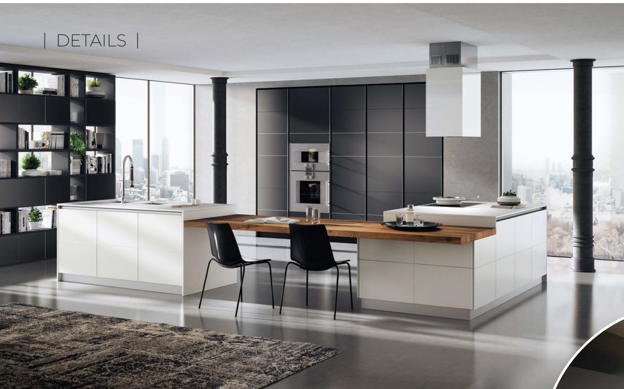
LEFT: The Tetrax kitchen by SCAVOLINI basically divides the island and then bridges it together with a wood surface for dining or prep work. scavolini.com