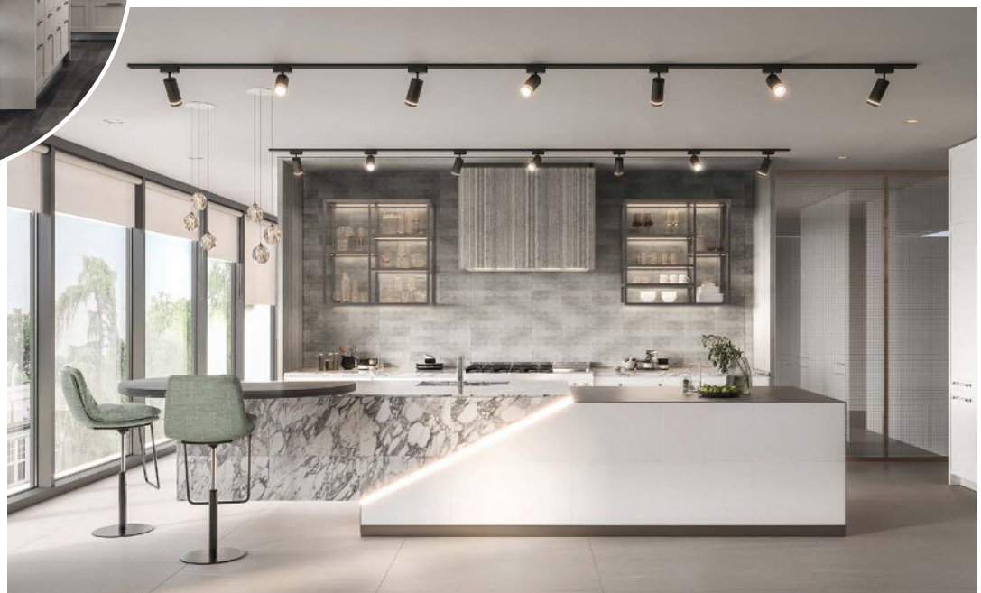
BELOW: Just released from EGGERSMANN , the Skywalk island offers an avant-garde cantilevered structure that's further elevated by the clever play of angled LED detailing. eggersmannusa.com