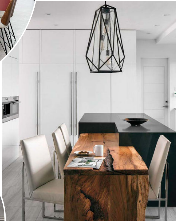
LEFT: In this PHIL KEAN kitchen, a walnut waterfall table was attached to the island to provide warm organic contrast against the colder surfaces in the room. philkeankitchens.com

KITCHEN ISLANDS INCREASE THEIR UTILITARIAN AND AESTHETIC VALUE WITH EXTENSIONS THAT ARE BOTH PRACTICAL AND ELEGANT