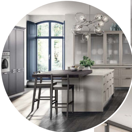
ABOVE: The island of the Carattere kitchen by SCAVOLINI offers an ash hardwood addition that can serve as a dining surface or additional prep space for when there's more than one cook at work. scavolini.com