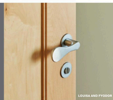
LOUISA AND FYODOR

Case studies and products. Read on page 33.